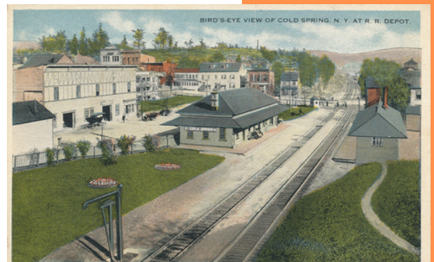
Mark Forlow Postcard Collection