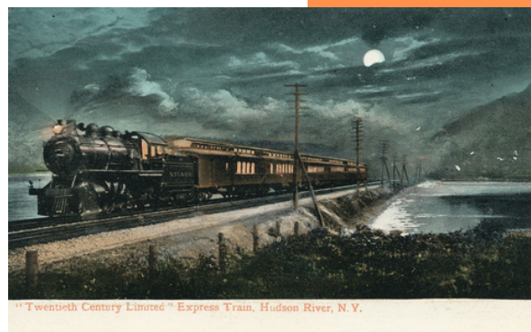
"Twentieth Century Limited" Express Train, Hudson River, N. Y.