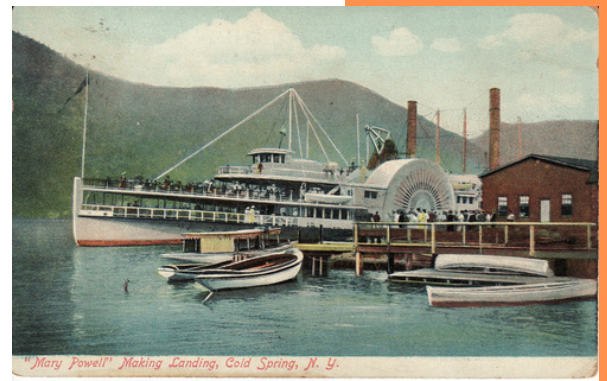
PHM Postcard Collection