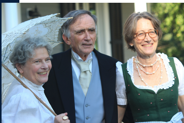
2021 PHM Lawn Party at the Historic William Kemble Home