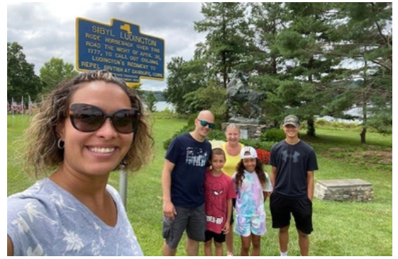
2021 History Hunt Participants