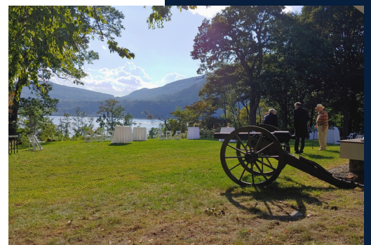
Replica Parrott Cannon at the William Kemble Home